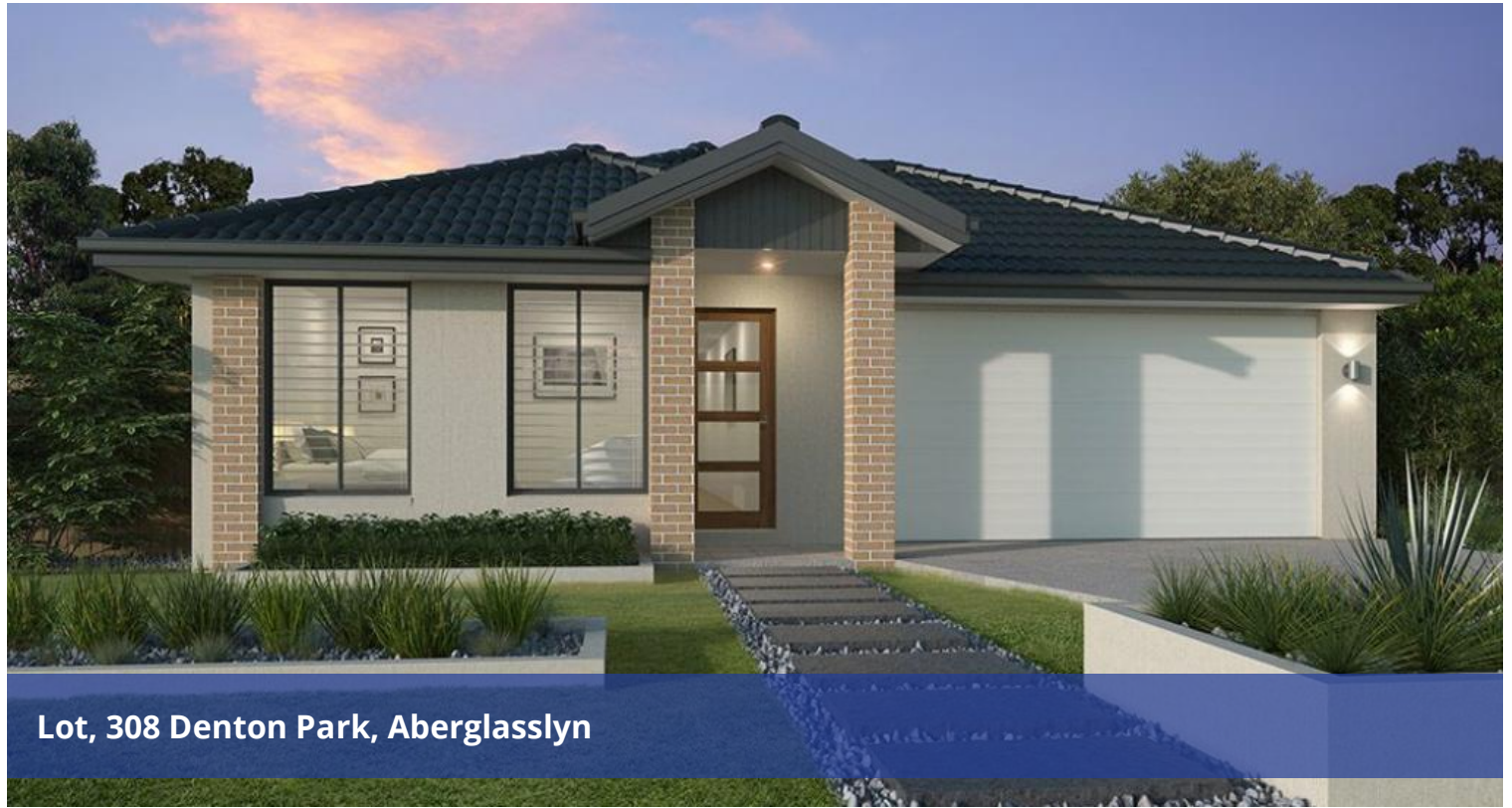
Lot, 308 Denton Park, Aberglasslyn