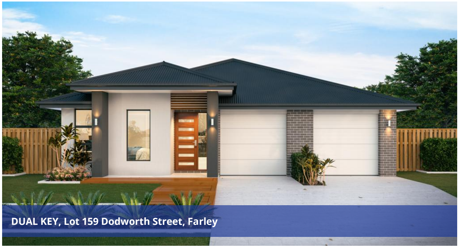
DUAL KEY, Lot 159 Dodworth Street, Farley