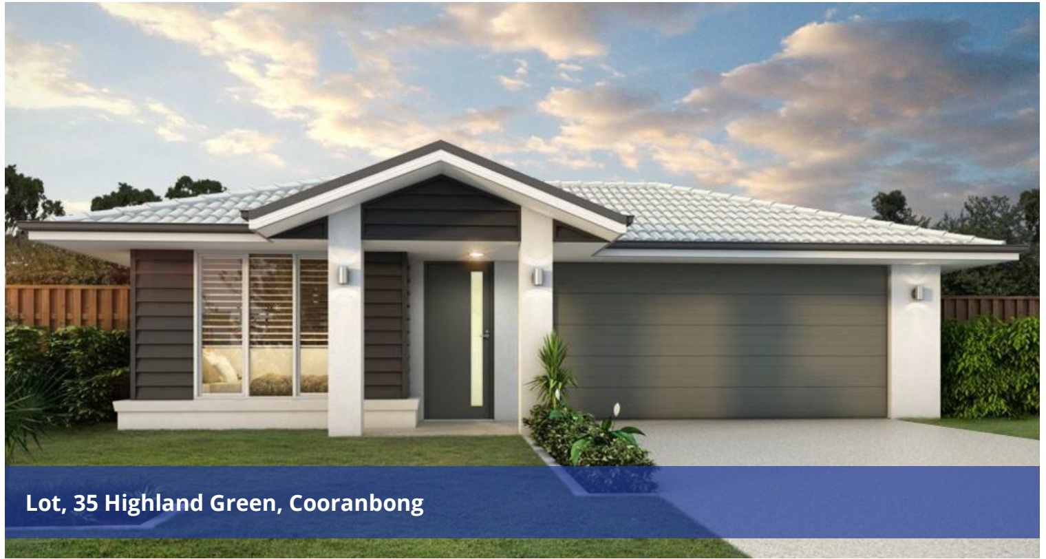
Lot, 35 Highland Green, Cooranbong