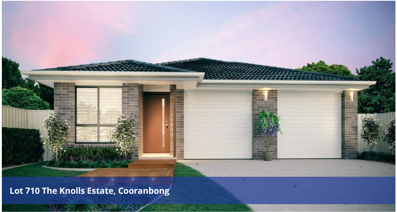
Lot 710 The Knolls Estate, Cooranbong